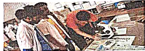
Department of Microbiology