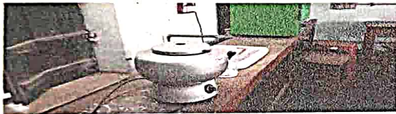
Department of Zoology

Library: The Policy of the College authority is to enrich the Central Library of the college with new books as per the New CBCS curriculum. The College authority also desires to create a digital-based book lending and accepting technology and to maintain the existing books by proper maintenance and upkeep. Accordingly, the Library sub-committee and Finance sub-committee work together to build up a well equipped library facility to its stakeholders. The budget allocations are made towards entry of all books in the computer system, books are purchased, computers and printers are provided and cleaning, dusting and disinfecting process are carried out during the year.